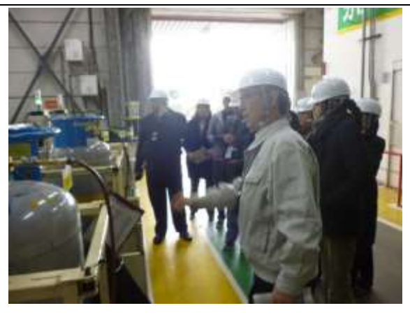
Tokyo Eco Recycle Co., Ltd