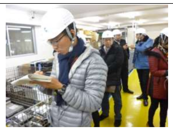
Tokyo Eco Recycle Co., Ltd