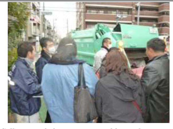
Collection of plastic waste and hazardous waste