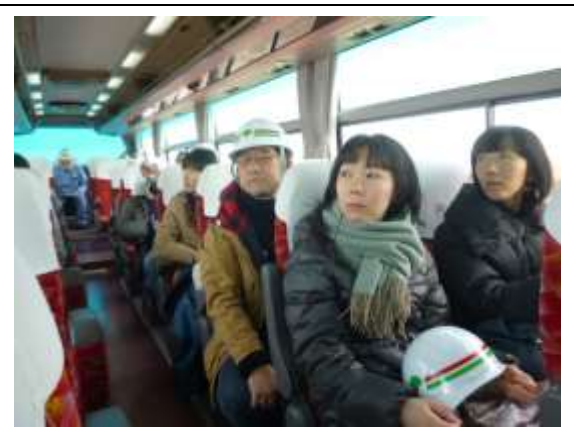
Tokyo Bay-side landfill