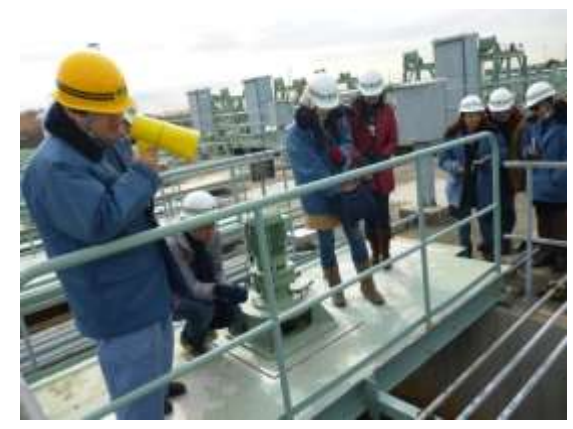
Waste water treatment plant at FDS