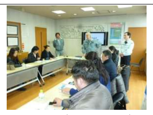
C&D Recycling (Takatoshi Corporation)