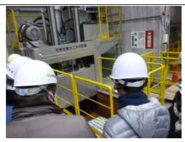
Craching machine for balky waste