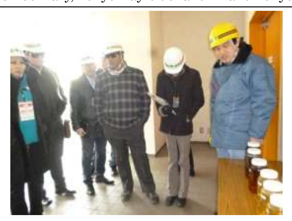
Waste water treatment plant at FDS