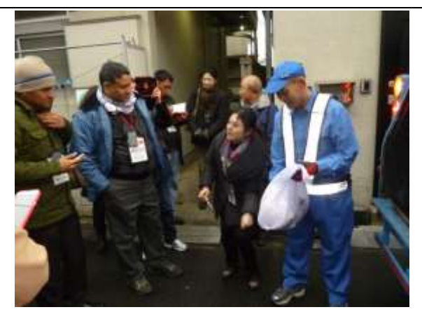
Collection of combustible waste