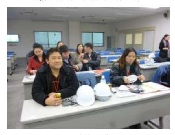
Recycle Center / Clean Center Fujimi