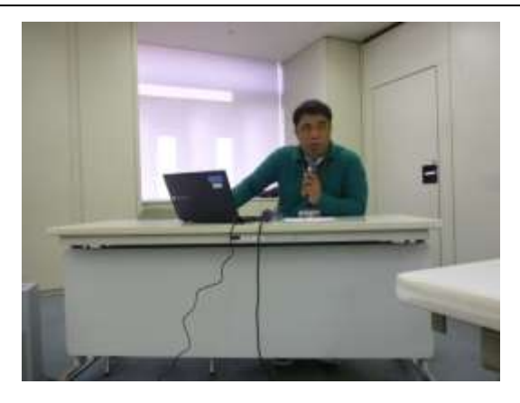
E-waste recycling in each city