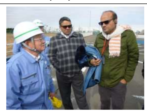
Tokyo Bay-side landfill