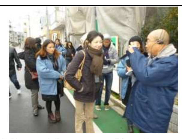
Collection of plastic waste and hazardous waste