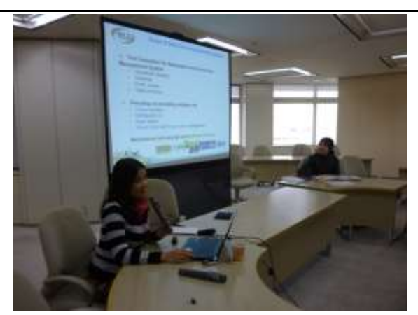
Boom - Presentation #1 MSW