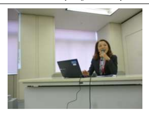
E-waste recycling in each city