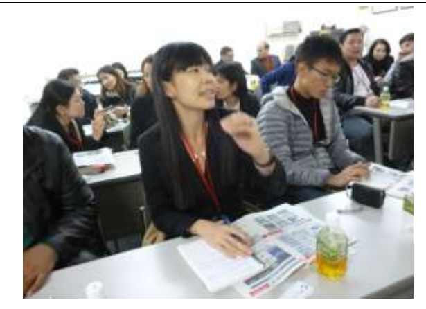
Tokyo Eco Recycle Co., Ltd