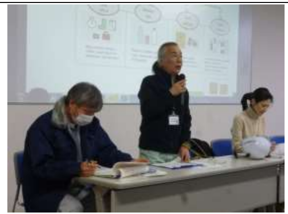
Recycle Center / Clean Center Fujimi