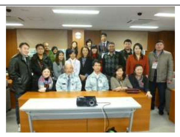
With Mitaka city