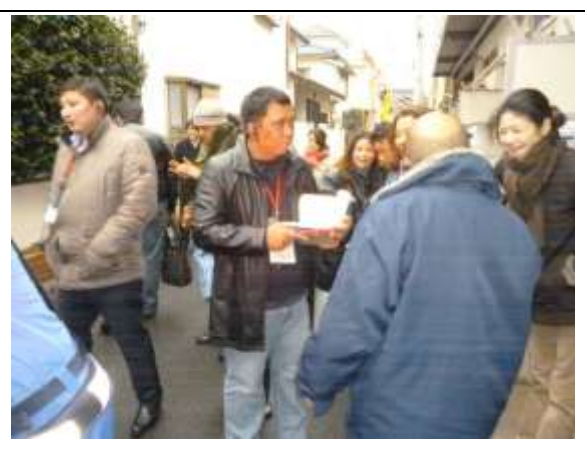
Collection of combustible waste