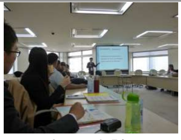
Orientation by Taka