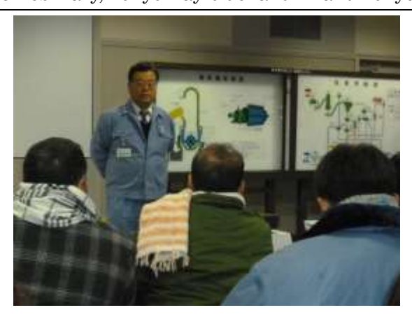
Head of Tokyo Bay-side Landfill management office