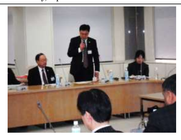
On 7 February, Open lecture on installation of waste disposal and recycling facility in Asian cities.