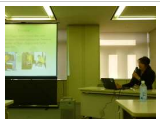
E-waste recycling in each city