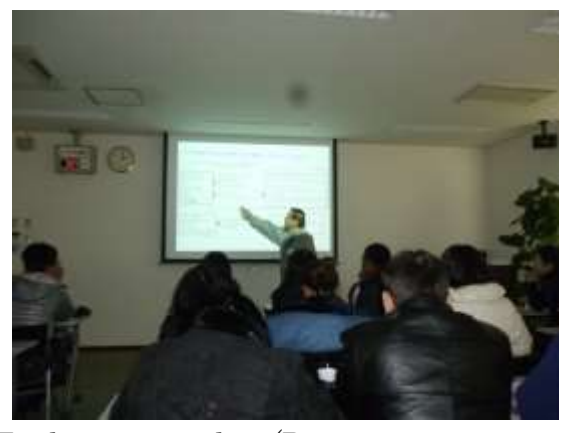
Food waste recycling (Bioenergy corporation)