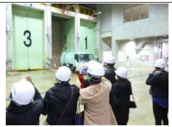
Incineration plant / Clean Center Fujimi