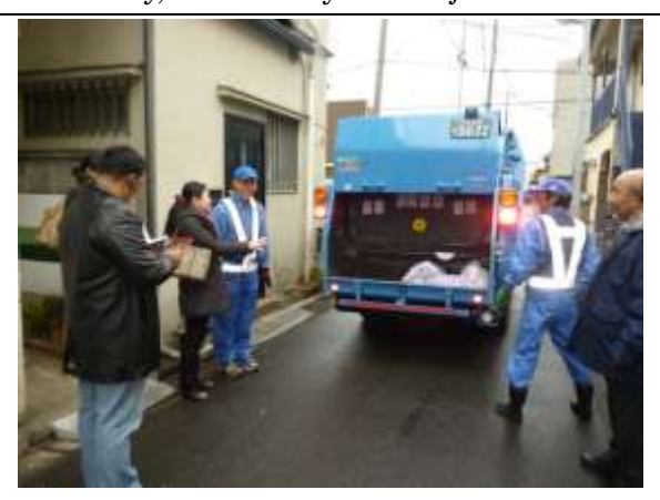
Collection of combustible waste