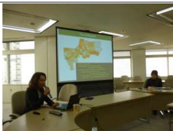
Tas - Presentation #1 MSW