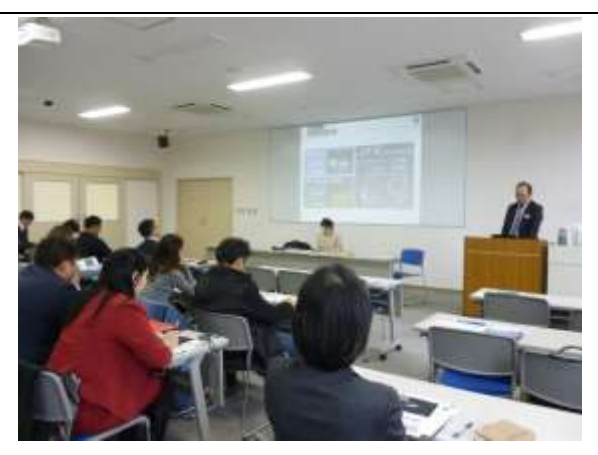
JFE Engineering / constructor and operator of Fujimi