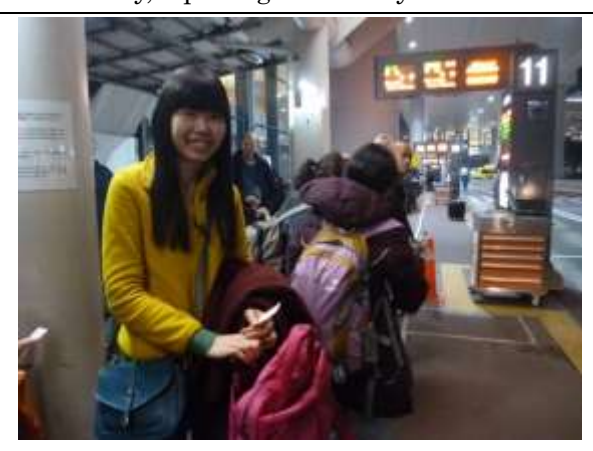
Arrival on 2nd